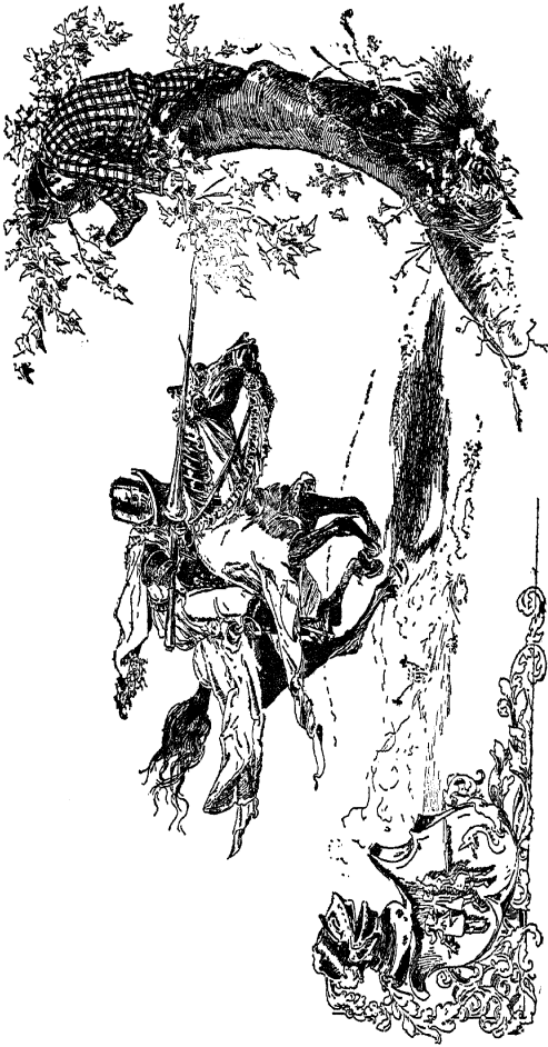
"I SAW HE MEANT BUSINESS"